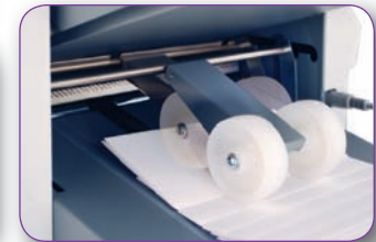
Automatically adjusting stacker wheels to accommodate various fold types