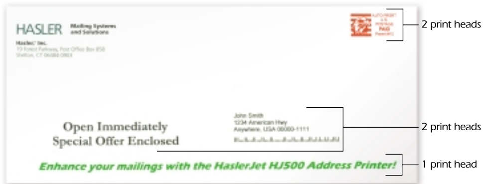
Sample printed on corporate stationery