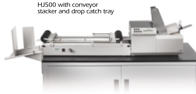
HJ500 with conveyor stacker and drop catch tray